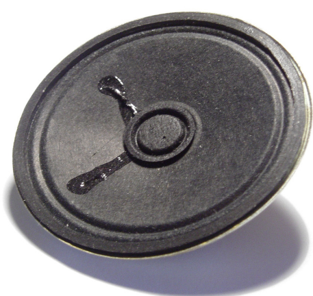
SPEAKERS make sound. Magnetic!