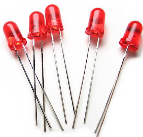
LEDs light up. May be different colors.