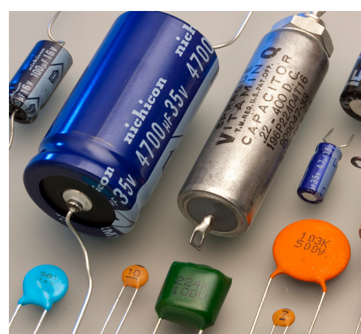
CAPACITORS store electricity temporarily.