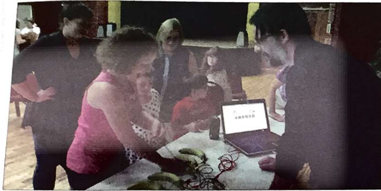
The Benzonia Public Library is just wrapping up its hugely popular "Building Up S.T.E.A.M. Summer Reading Program, which allowed kids of all ages to play with gizmos like Makey Makey.